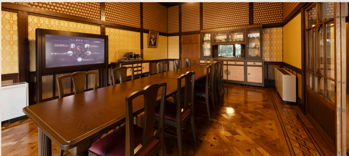
The dining hall (restored appearance)