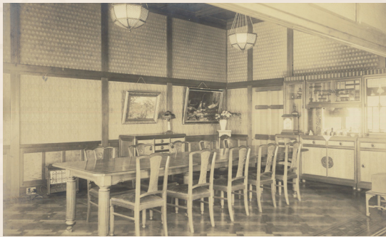
The dining hall (original appearance)

The dining hall cabinet, decorated with grapevine and squirrel designs, was restored based on the old photographs of this room. The color and pattern of the wallpaper were also determined based on color analysis estimations using them, and it was concluded that the wainscoting wallpaper had a double phoenix pattern, and the wallpaper above the nageshi beam had a cockscomb pattern.