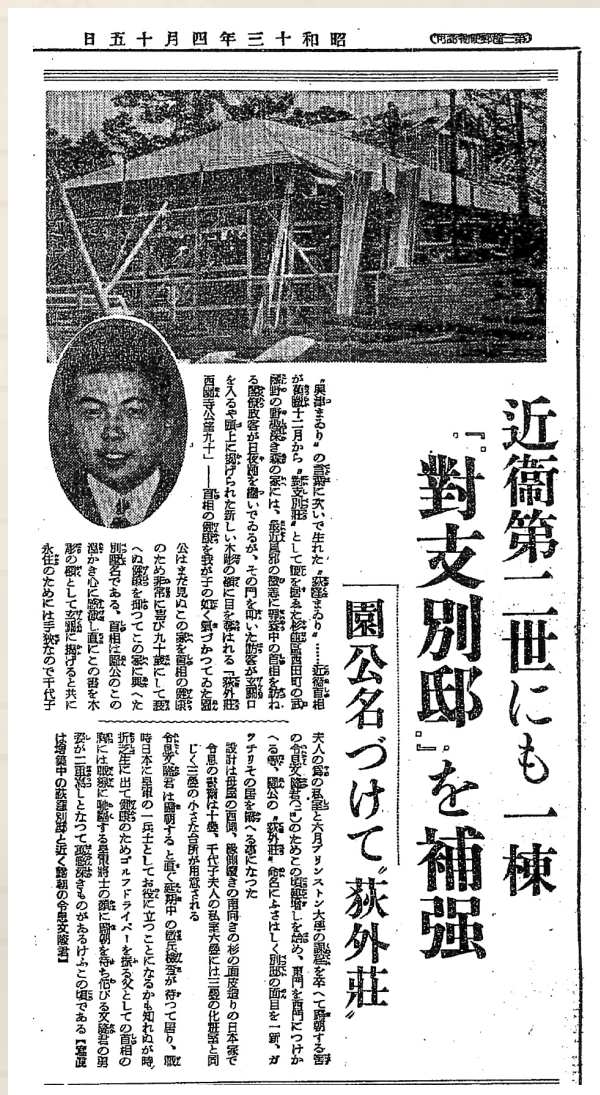
The newspaper article reporting on the construction of the outbuilding The Asahi Shimbun, April 15, 1938