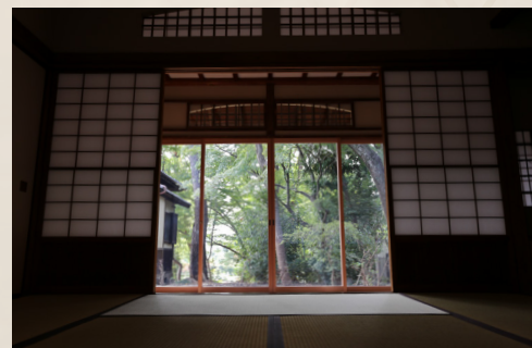
The outbuilding (restored appearance)